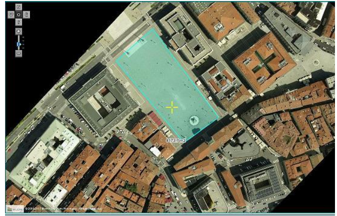
Measure of surface