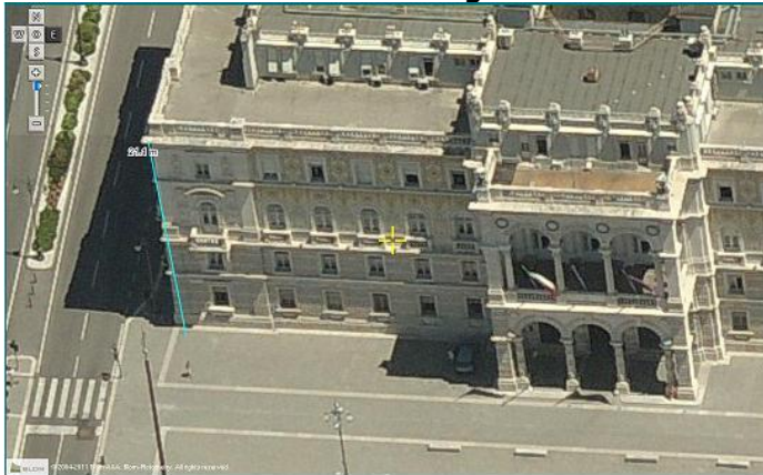
Measure of height

The use of oblique images makes possible to measure height, surface and width of buildings as well as distances to resources and rescue assets.